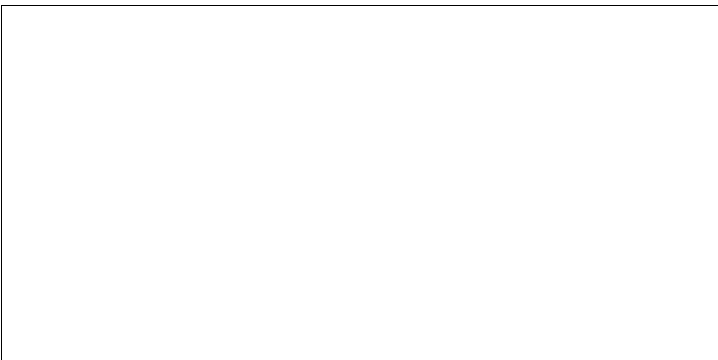
Actual Bar Size – top view

Soybean Oil creates a hard, white bar of soap with a lather that is mild and stable, helping it to last throughout the length of the bath. Soybean adds conditioning properties to the soap and is environmentally friendly.