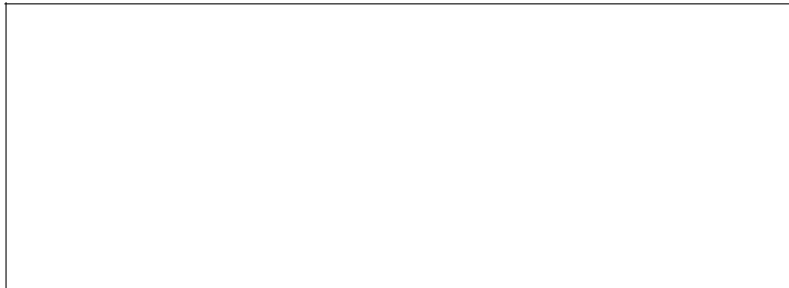
Actual Bar Size – side view (thickness of bar)